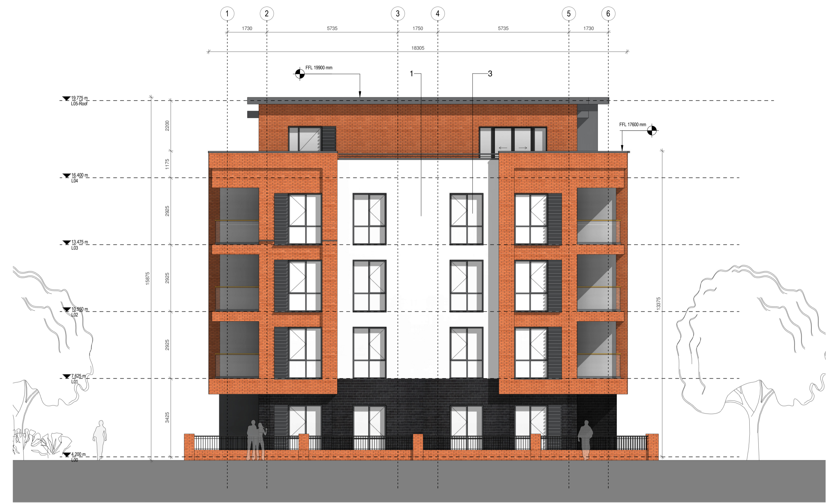
2 ELEVATION.D 1 : 100 1:200@A3